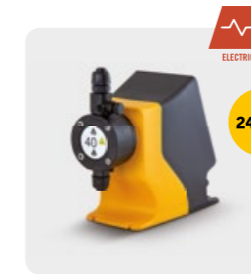
DOSMART AC (24VDC)

Dosing pumps for 12 or 24 VDC batteries or solar panels and additional dosing pumps powered by the irrigation water without any loss of pressure.