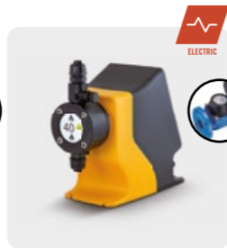
DOSMART AC (+ WOLTMAN WATER METER)