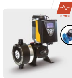
DOSTEC AC (+ WOLTMAN WATER METER)

Advanced-control dosing pumps, with dosing in proportion to the flow rate, with no need for a controller.