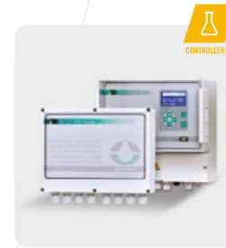
WATER CONTROLLER 3000