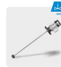
MIXERS (0.6 / 1.1 / 1.3 / 1.5 / 2.0)

Turbine mixers with outstanding efficiency for dissolving solid fertilisers and mixing together products in tanks.