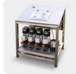
DOSING AND CONTROL STANDS