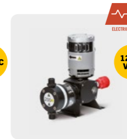
DOSTEC 40 (12-24VDC)