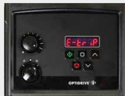
Local display of activated protection