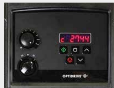
Flow rate flexibility

The iDura's control panel includes forward and reverse pumping direction controls. These can save time clearing blocked feed lines, save money by recovering valuable flavourings, essences and chemicals or they can simply help speed up an infrequent hose changeover. However, such controls can be abused and they are lockable to prevent unauthorised access.