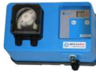
REDOX potential controller for chlorine